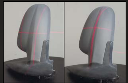
Measurement volume positioning lasers.

Scan3D DUAL VOLUME is precise non-contact measurement device which thanks to the latest LED light technology and GigaBit Ethernet communication, enables rapid execution of complex measurements. As a professional tool for metrology each 3D scanner is certified according to VDI / VDE 2634 standards and its accuracy can be confirmed by independent accredited metrology lab with adequate certificate. scan3D DUAL VOLUME has two independent measurement volumes featuring different workspace, accuracy and measurement resolution. Large volume allows automated measurement of overall dimensions using markers for merging single shots. On the other hand, small volume allows precise measurements of smaller details such as threads and in high-resolution mode (up to 1500 points/mm 2 ).